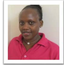
Miss Rita Nursery Practitioner